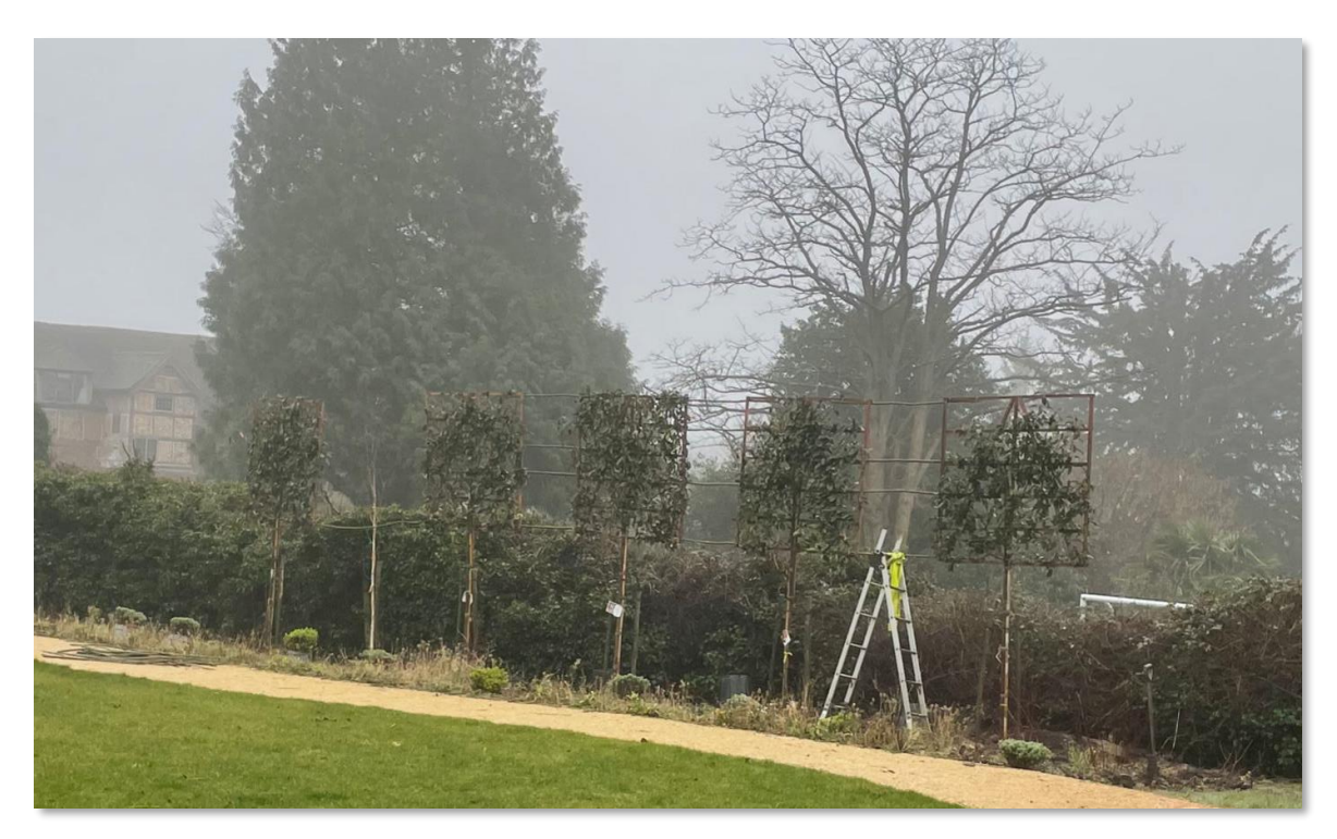
FIGURE 7 ESPALIERED TREES BEING PLANTED AT THE ANGELA FOX NATURE GARDEN, SAM HEYNES 2022

The final improvement to the garden at the Queen's Hall this year was to replace the rotting and loose decking area. Opting for composite decking as this will last much longer and require less maintenance, we are very pleased with the result.