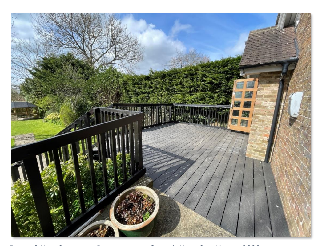
FIGURE 8 NEW COMPOSITE DECKING AT THE QUEEN'S HALL, SAM HEYNES 2022

The final improvement to the garden at the Queen's Hall this year was to replace the rotting and loose decking area. Opting for composite decking as this will last much longer and require less maintenance, we are very pleased with the result.