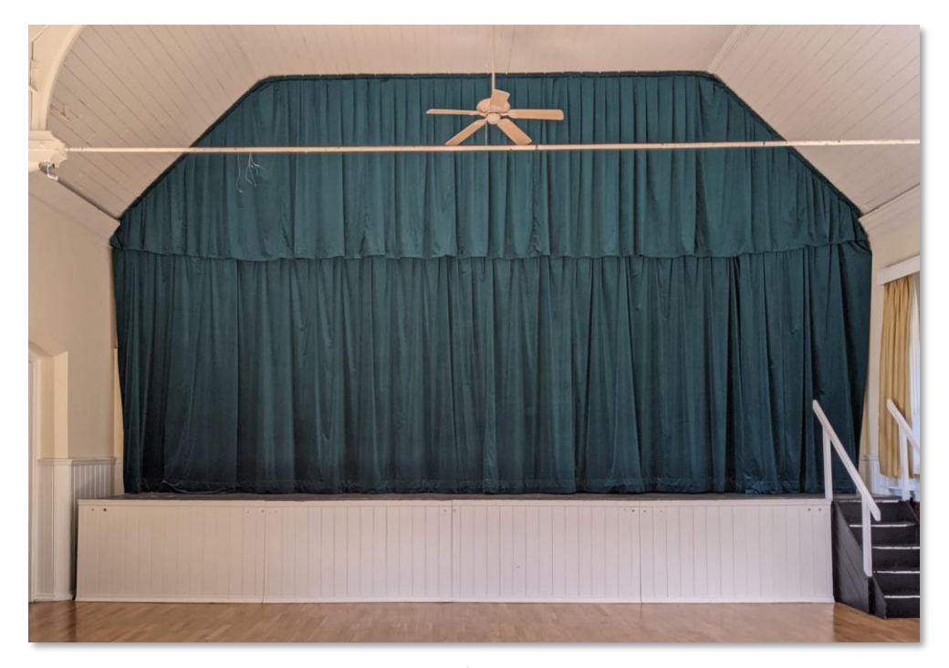
FIGURE 6 NEW STAGE CURTAINS AT THE QUEEN'S HALL, CUCKFIELD, SAM HEYNES 2021

The Bookfest returned in October and was very well supported. Cuckfield Museum is housed in the Queen's Hall and after restricted opening it will be back to the usual four mornings a week from mid-April. Sadly, despite our best efforts, re-opening the Post Office in the hall has failed as the Postmaster is unable to find staff to cover the two mornings that we hoped to establish. This is very disappointing for all and a great blow for the village.