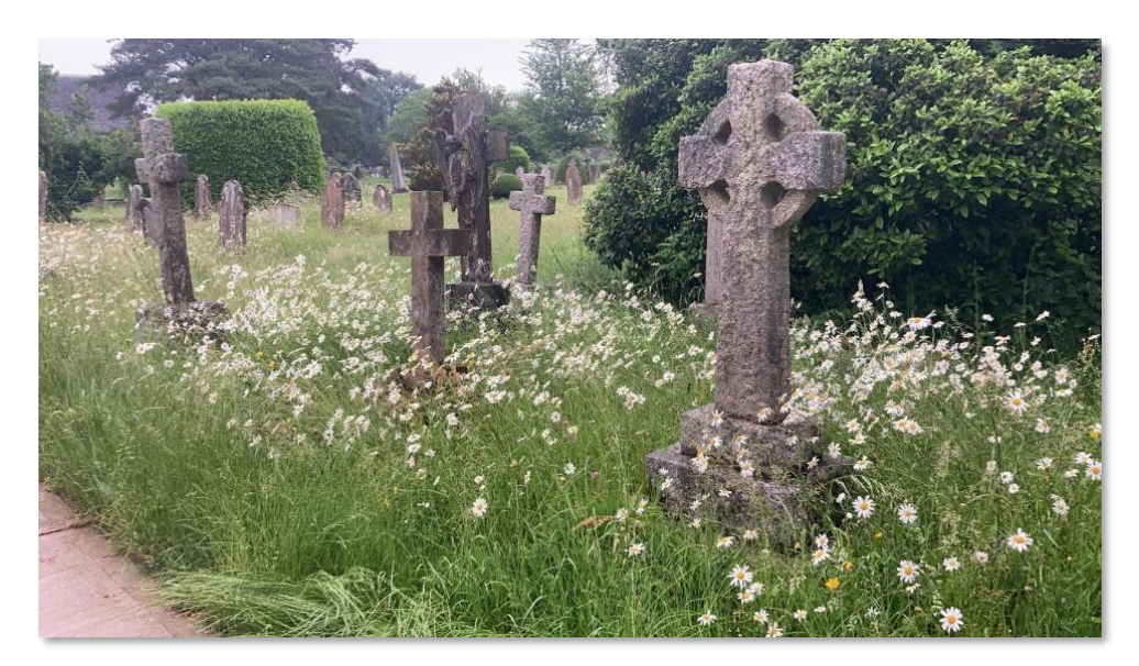
FIGURE 2 OX-EYE DAISIES AT THE CEMETERY, HOLY TRINITY CHURCH, SAM HEYNES 2021

The toilets in Broad Street car park have been subject to some minor incidents of vandalism. Thanks to a successful grant application to Sussex Police Crime Commission, external CCTV will be installed in April 2022 in what will hopefully be a preventative measure.