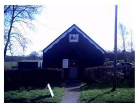
The Old Chapel, Brook Street

more careful landscape architecture. However, once inside the development, the open green at the centre of the housing is very pleasant and much used by the residents.