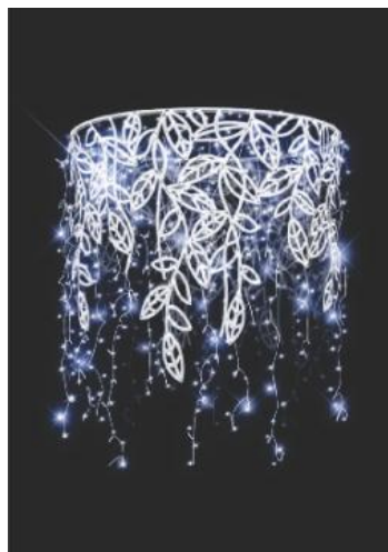
lamp post display