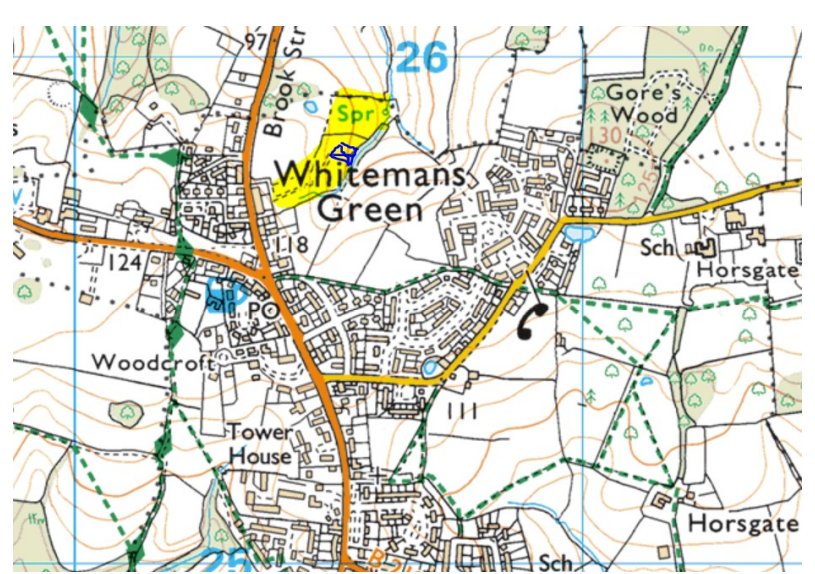
Figure 1. Location – OS leisure map

As a team we have been previously successfully at securing almost £5k of grant from the Sussex Lund on behalf of the school for development of the wildlife pond and butterfly meadow. Projects which we are currently managing. We also have the support of several other plot holders.