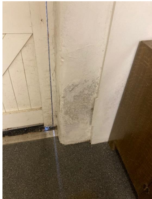
Damp to the internal door frame (left and right sides)