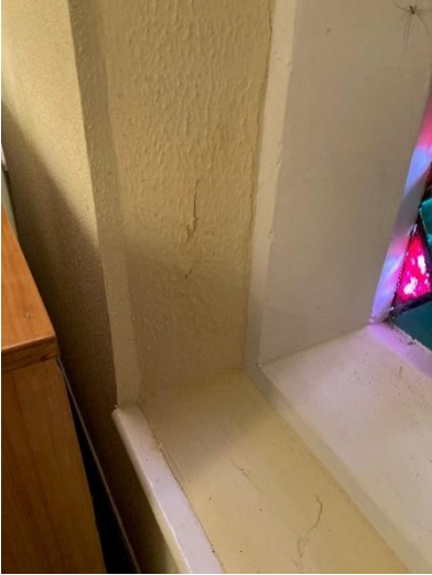
Signs of repair required around both windows, possibly caused by damp plaster.