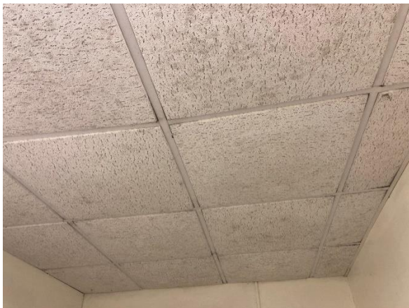
Damp on ceiling tiles.