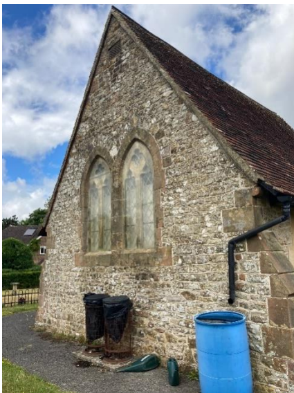
External showing the windows which are not visible internally as they have been boarded up and form part of the Chapel of Rest. This room also has a false ceiling, although appears to be plastered rather than ceiling tiles.