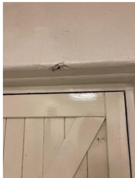
Historical signs of damage above the door frame.